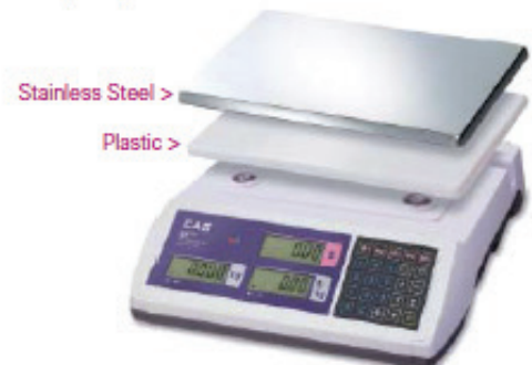
Stainless Steel >

Designed with both plastic and stainless steel trays that are made from heavy-duty and washable materials.