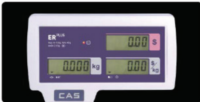
LCD Display ▲

The ER PLUS comes with an LCD display. Choose between the standard non-pole type or pole type display. The pole type display is reversed so that clients are in full view of price and weight.