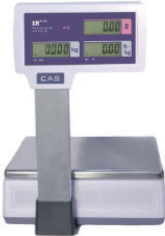
▲ Client view pole display