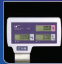
Client view pole display