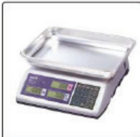
▲ Fish Tray