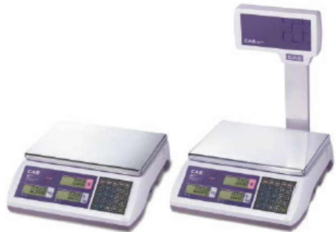
Standard Type ▲