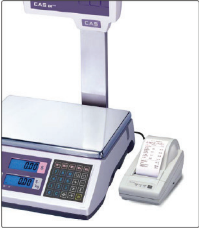
▲ Sample of a Ticket