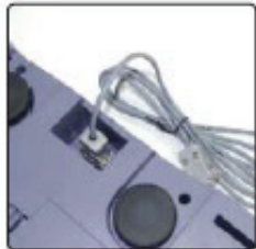
▲ RS-232C Interface