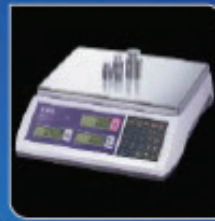
Dual interval technology