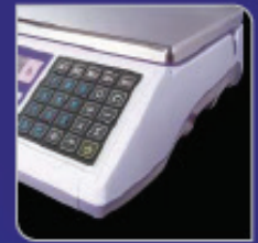
Soft touch key pad