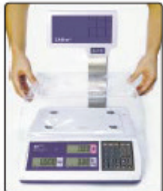
▲ Dust Protection Cover