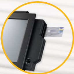
Magnetic / Smart Card Reader