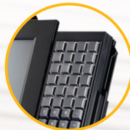
40 Programmable Keypad