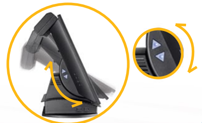
Motorized Angle Adjustment